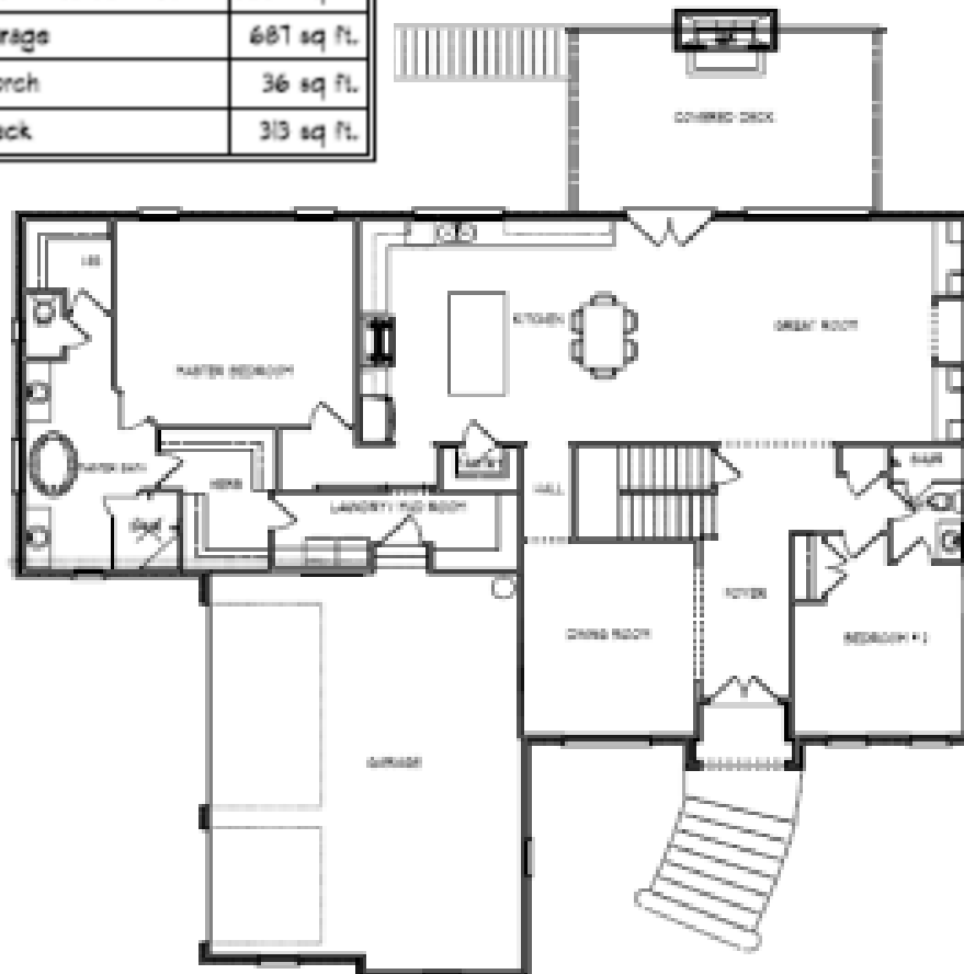
Main Floor SCALE 1/4" = 1'-0"